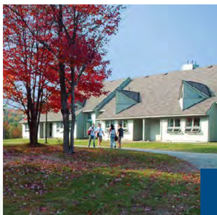
Townhouse Residence Complex 100 College Dr. North Bay, ON

For more information about delivery & mailing addresses, see page 16