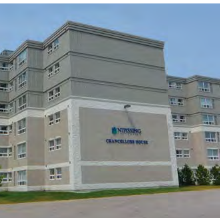
Chancellors House 900 Gormanville Rd. North Bay, ON