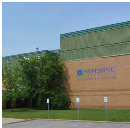
Founders House 1 College Dr. North Bay, ON