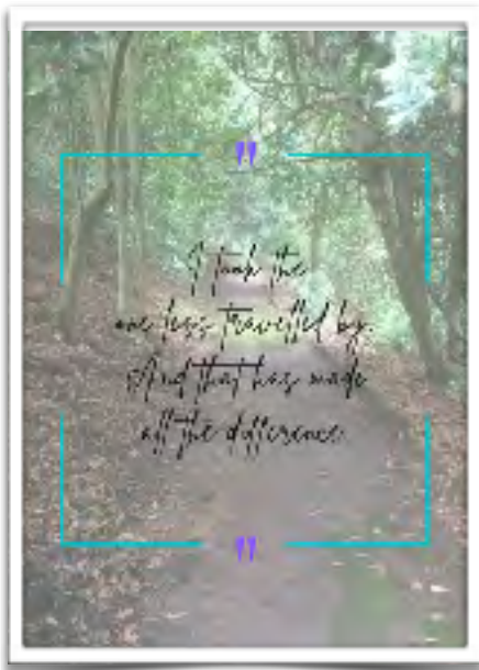
Image: A Road in a Wood (Hawthornden Castle, Scotland) and a line from Frost's poem The Road Not Taken