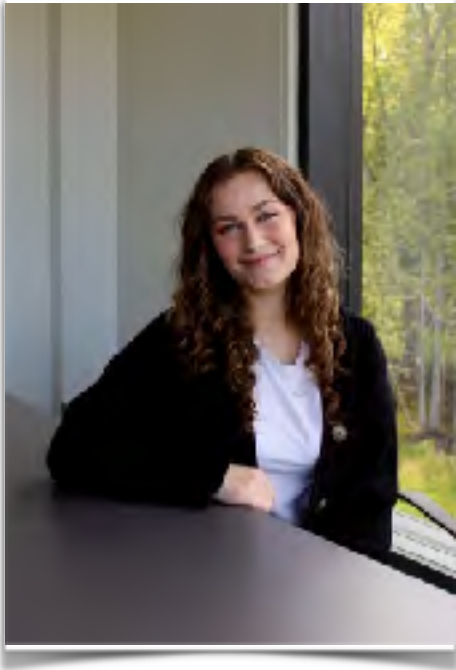
Image: a young woman sitting at a conference table, smiling