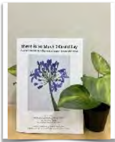
Image: Poetry Anthology, 'There Is So Much I Could Say'