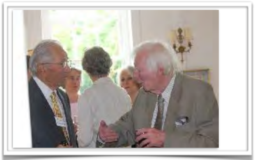
Image: a group of adults discussing current events