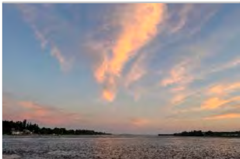
Image: Summer Solstice Sky of peachy-pink clouds above the Ottawa River

Knowledge Exchange Research Updates Student Placements