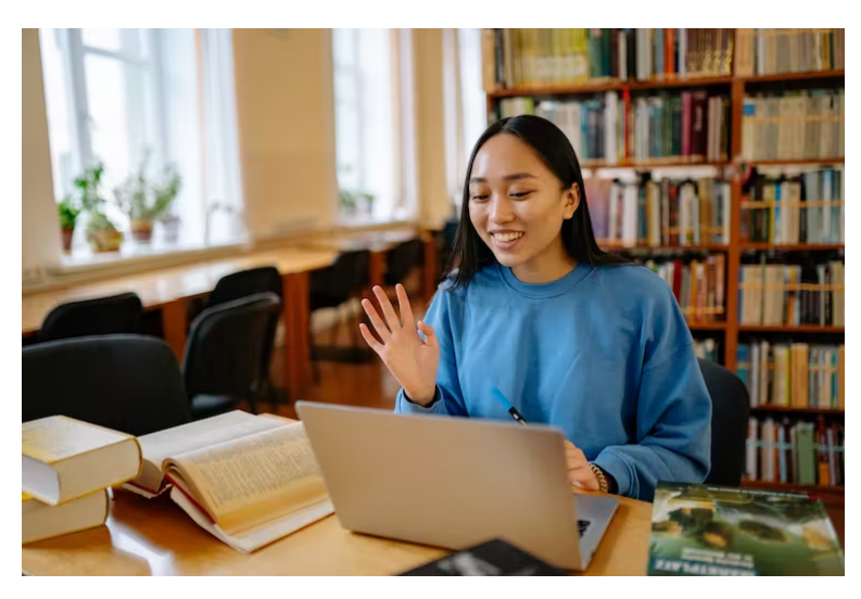
Students were grateful when, depending on their symptoms, they could choose between in-person or recorded or streamed lectures.