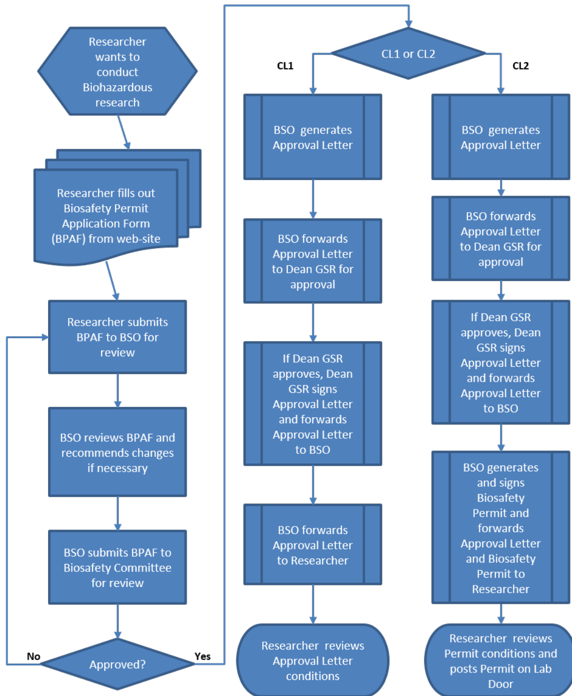
FIGURE 1. Biosafety Permit Application Process. CL1 (Containment Level 1); CL2 (Containment Level 2); BSO (Biological Safety Officer); Dean GSR (Dean Graduate Studies and Research).